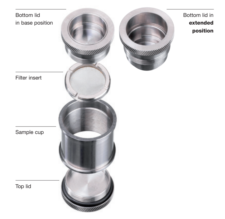
Fig. 1: Design of the sample cup