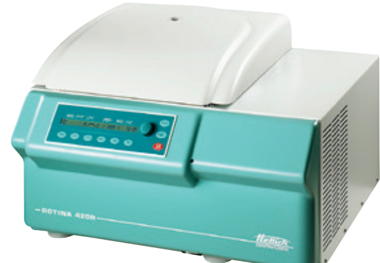
ROTINA 420 R Benchtop centrifuge, cooled