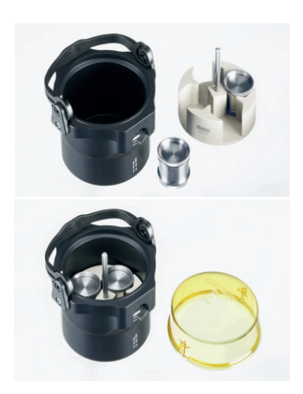
Carrier 4780 with lid 4783 and special accessories for determination of WHC.

A determination of the WHC and cook loss allows conclusions to be drawn about the degree of denaturation of the proteins and therefore the quality of the fish. It is therefore an objective and reproducible method.