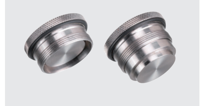
Fig. 2: Bottom lid in base position (left) and in extended position (right)

This flexible solution allows adaptation to different sample quantities and ensures an optimal heat transfer during the heating process.